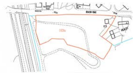
Location plan 1:1250